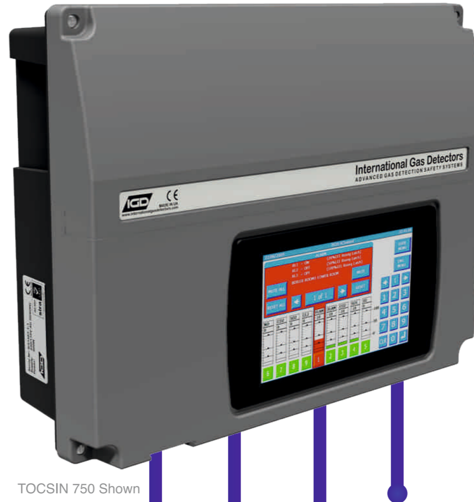
TOCSIN 750 Shown